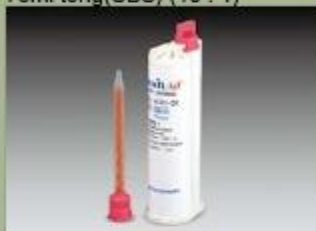
75ml tong(SBS) (10 : 1)