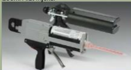
250ml Alat Injeksi