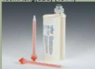
490ml tong(SBS) (10 : 1)