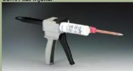
50ml Alat Injeksi