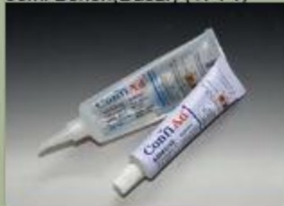
63ml Benen(Dasar) (17 : 1)