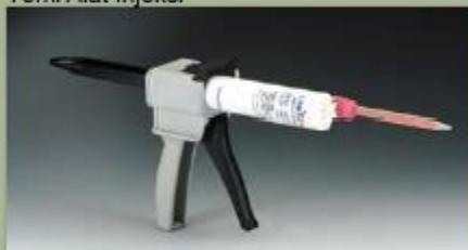
75ml Alat Injeksi