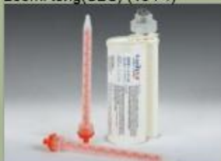
250ml tong(SBS) (10 : 1)