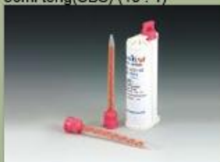
50ml tong(SBS) (10 : 1)