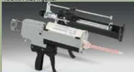
490ml Alat Injeksi