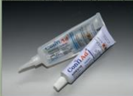
63ml tube(caighdeán) (17 : 1)